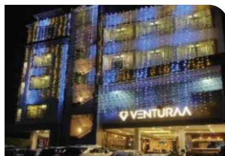
Hotel Ventura - 200m