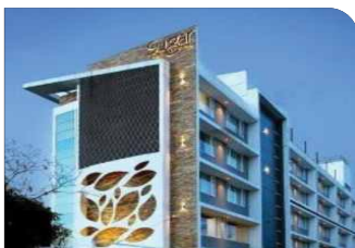
Sugar Business Hotel - 2 km