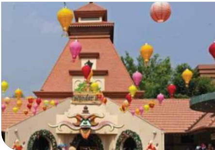
Wonderla Amusement Park (20km)