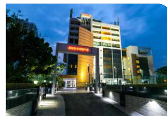
IMA House, Kochi - 9km

Ernakulam Railway Station -Town (North) - 11 km, Junction (South) - 9 km Kochi International Airport - 33km