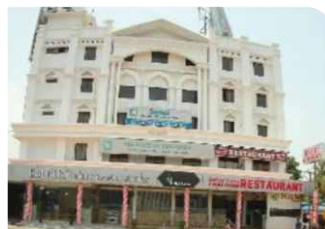
Empire the Grand Suites - 500m