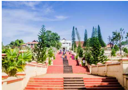
Hill Palace Museum (7km)