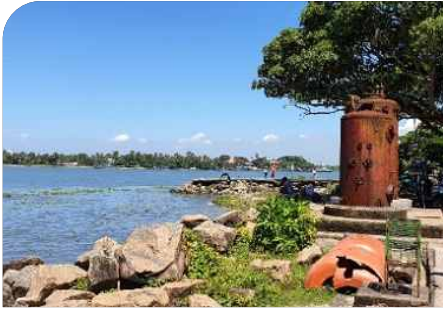
Fort Kochi Beach (13km)