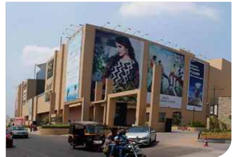
Lulu Mall Kochi (12km)