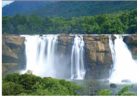
Athirapally Waterfalls (68km)