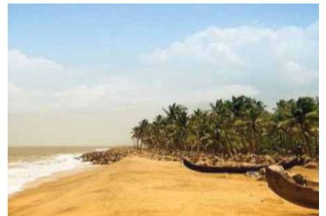
Cherai Beach (35km)