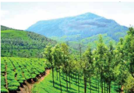
Munnar Hill Station (122km)