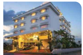
Hotel Cochin Legacy 600m